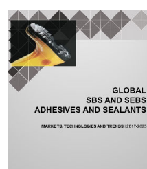
2018 Global SBS and SEBS Adhesives and Sealants