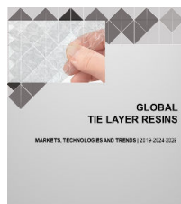
2019 Global Tie Layer Resins